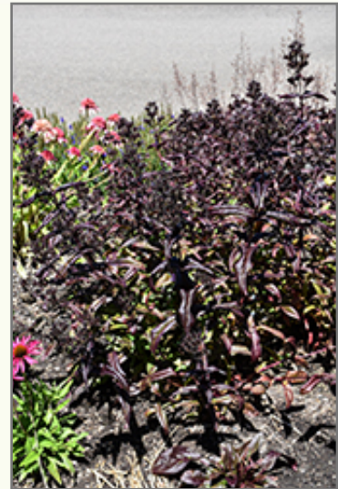
Dakota Burgundy Beard Tongue

Dakota Burgundy Beard Tongue is a fine choice for the garden, but it is also a good selection for planting in outdoor pots and containers. With its upright habit of growth, it is best suited for use as a 'thriller' in the 'spiller-thriller-filler' container combination; plant it near the center of the pot, surrounded by smaller plants and those that spill over the edges. Note that when growing plants in outdoor containers and baskets, they may require more frequent waterings than they would in the yard or garden. Be aware that in our climate, most plants cannot be expected to survive the winter if left in containers outdoors, and this plant is no exception. Contact our experts for more information on how to protect it over the winter months.