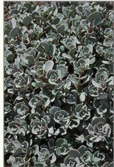
Lidakense Sedum foliage

Lidakense Sedum is recommended for the following landscape applications;