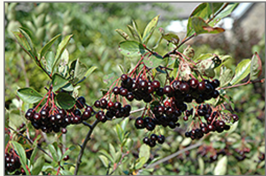
Autumn Magic Black Chokeberry fruit

Autumn Magic Black Chokeberry will grow to be about 5 feet tall at maturity, with a spread of 4 feet. It tends to be a little leggy, with a typical clearance of 1 foot from the ground, and is suitable for planting under power lines. It grows at a slow rate, and under ideal conditions can be expected to live for approximately 20 years.