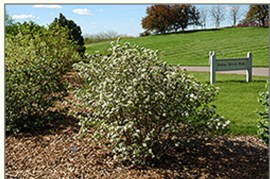
Autumn Magic Black Chokeberry in bloom