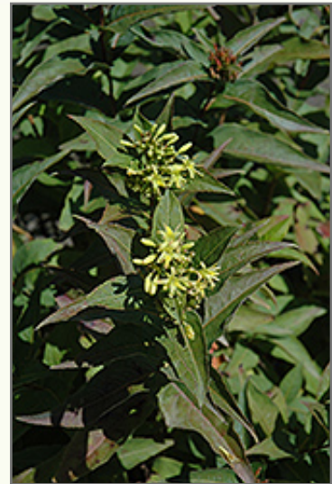
Butterfly Bush Honeysuckle flowers