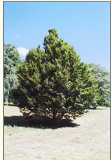
Blue Beech

This tree will require occasional maintenance and upkeep, and is best pruned in late winter once the threat of extreme cold has passed. It has no significant negative characteristics.