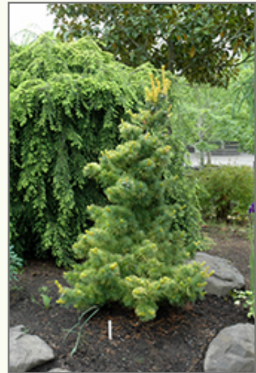
Goldilocks Japanese White Pine in spring

This shrub does best in full sun to partial shade. It prefers dry to average moisture levels with very well-drained soil, and will often die in standing water. It is not particular as to soil type or pH, and is able to handle environmental salt. It is somewhat tolerant of urban pollution. This is a selected variety of a species not originally from North America.