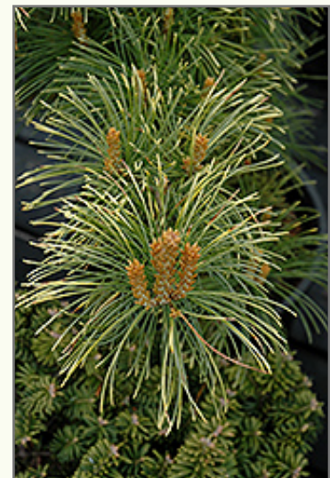
Goldilocks Japanese White Pine foliage