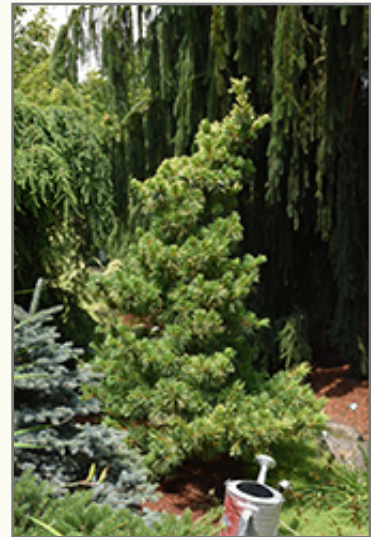
Goldilocks Japanese White Pine