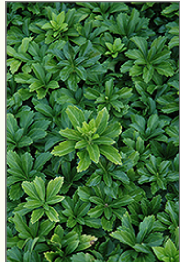
Green Sheen Japanese Spurge foliage