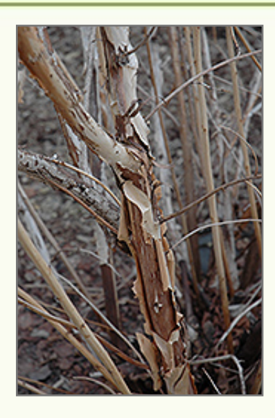
Dart's Gold Ninebark bark