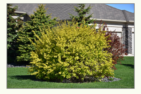
Dart's Gold Ninebark