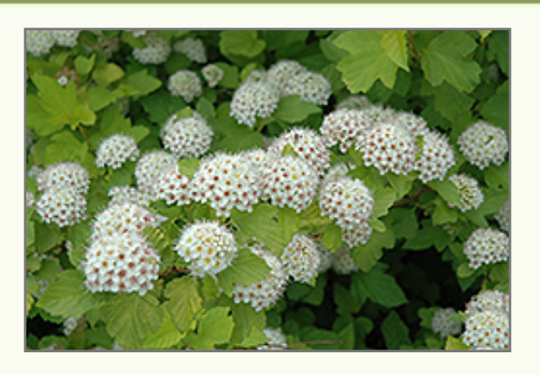
Dart's Gold Ninebark flowers

This shrub will require occasional maintenance and upkeep, and can be pruned at anytime. It has no significant negative characteristics.