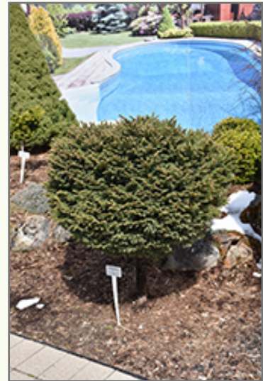
Little Gem Spruce (tree form)