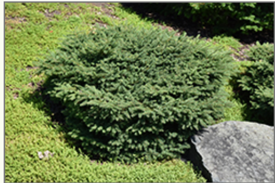
Bird's Nest Spruce

Bird's Nest Spruce is recommended for the following landscape applications;