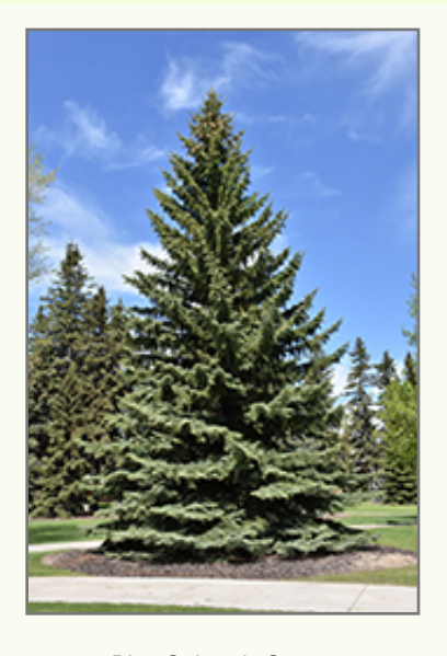
Blue Colorado Spruce

Blue Colorado Spruce is a dense evergreen tree with a strong central leader and a distinctive and refined pyramidal form. Its average texture blends into the landscape, but can be balanced by one or two finer or coarser trees or shrubs for an effective composition.