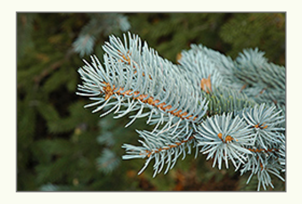
Blue Colorado Spruce foliage

This is a relatively low maintenance tree. When pruning is necessary, it is recommended to only trim back the new growth of the current season, other than to remove any dieback. Deer don't particularly care for this plant and will usually leave it alone in favor of tastier treats. It has no significant negative characteristics.