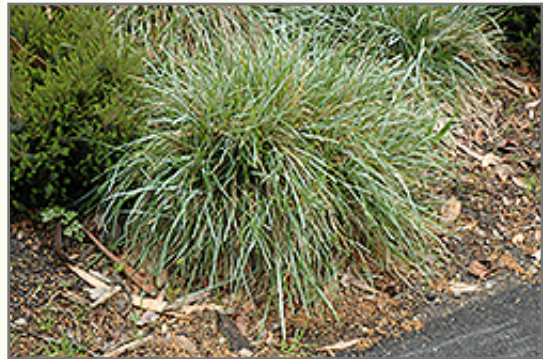
Blue Moor Grass