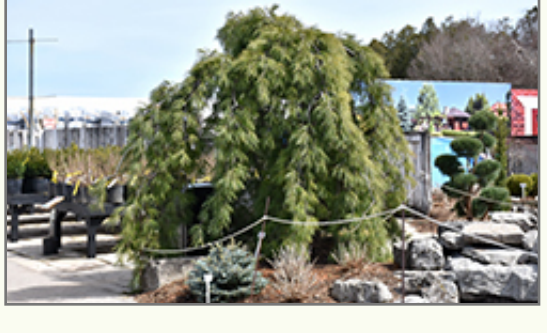
Weeping White Pine

A weeping and trailing shrub or small tree, very unlike the species; features soft, blue needles, tends to crawl along the ground and over rocks or walls, or forms a small weeping accent plant if trained on a standard; beautiful if properly grown