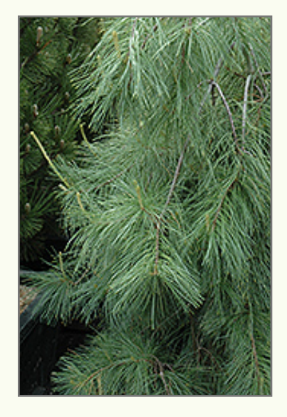
Weeping White Pine foliage

This shrub will require occasional maintenance and upkeep. When pruning is necessary, it is recommended to only trim back the new growth of the current season, other than to remove any dieback. Gardeners should be aware of the following characteristic(s) that may warrant special consideration;