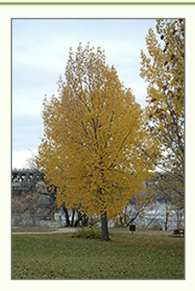
Siouxland Poplar in fall