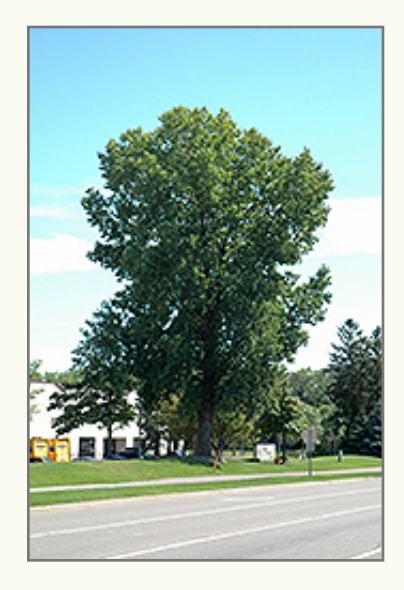
Siouxland Poplar