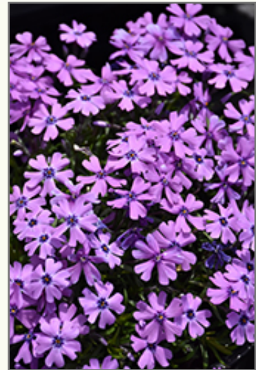
Purple Beauty Creeping Phlox flowers

This plant will require occasional maintenance and upkeep, and should only be pruned after flowering to avoid removing any of the current season's flowers. Deer don't particularly care for this plant and will usually leave it alone in favor of tastier treats. Gardeners should be aware of the following characteristic(s) that may warrant special consideration;