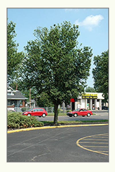
Jefferson American Elm