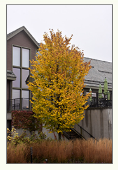
Jefferson American Elm in fall

Jefferson American Elm is recommended for the following landscape applications;