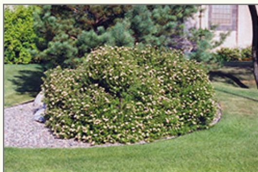
Pink Beauty Potentilla in bloom