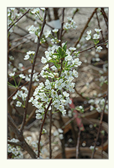
Superior Plum flowers