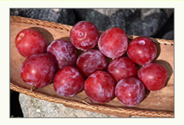
Superior Plum fruit