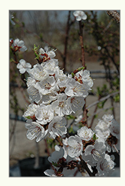
Sungold Apricot flowers