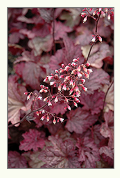
Berry Smoothie Coral Bells flowers

Berry Smoothie Coral Bells is recommended for the following landscape applications;