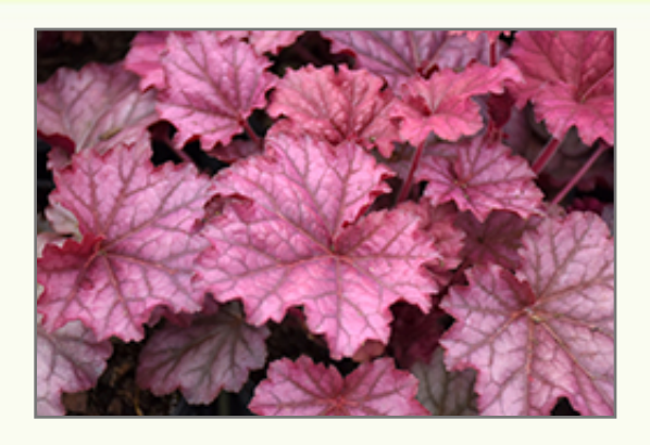
Berry Smoothie Coral Bells foliage

This is a relatively low maintenance plant, and should be cut back in late fall in preparation for winter. It is a good choice for attracting hummingbirds to your yard. It has no significant negative characteristics.