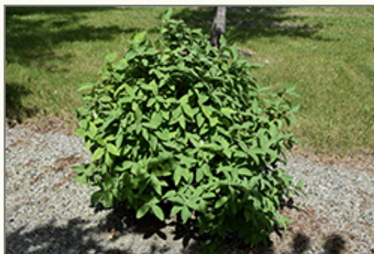
Borealis Haskap