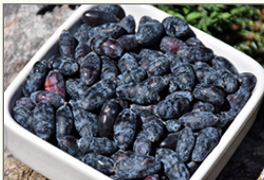
Borealis Haskap fruit

Borealis Haskap features subtle white flowers along the branches in early spring. It has green deciduous foliage. The narrow leaves do not develop any appreciable fall color. It features an abundance of magnificent blue berries in late spring.