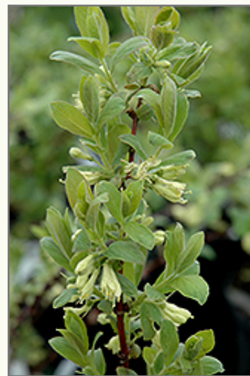
Borealis Haskap flowers