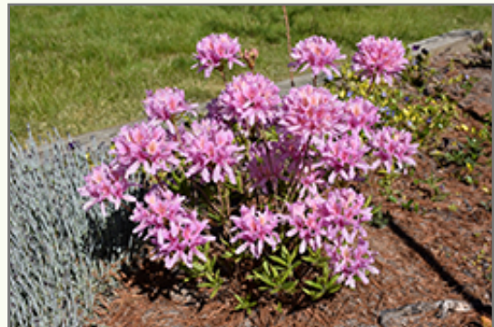
Orchid Lights Azalea in bloom