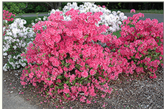
Rosy Lights Azalea in bloom