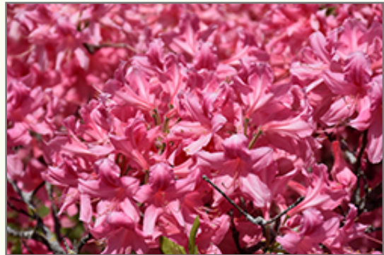
Rosy Lights Azalea flowers

This shrub will require occasional maintenance and upkeep, and should only be pruned after flowering to avoid removing any of the current season's flowers. It has no significant negative characteristics.