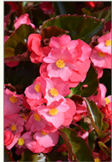
Big Rose Bronze Leaf Begonia flowers