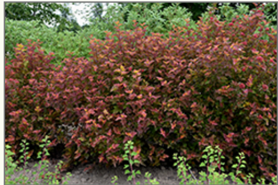
First Editions® Amber Jubilee® Ninebark