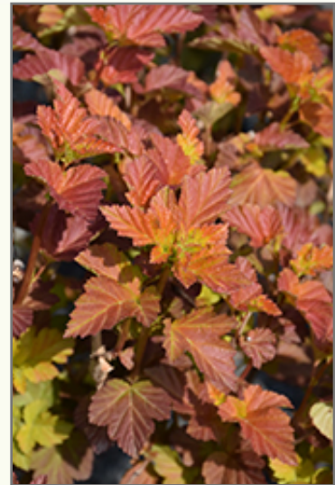
First Editions® Amber Jubilee® Ninebark foliage

First Editions® Amber Jubilee® Ninebark is a multi-stemmed deciduous shrub with an upright spreading habit of growth. Its average texture blends into the landscape, but can be balanced by one or two finer or coarser trees or shrubs for an effective composition.