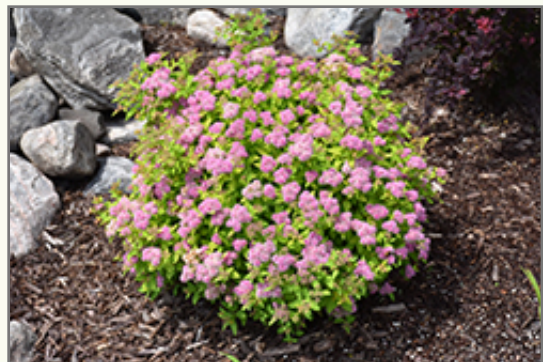
Dakota Goldcharm® Spirea in bloom