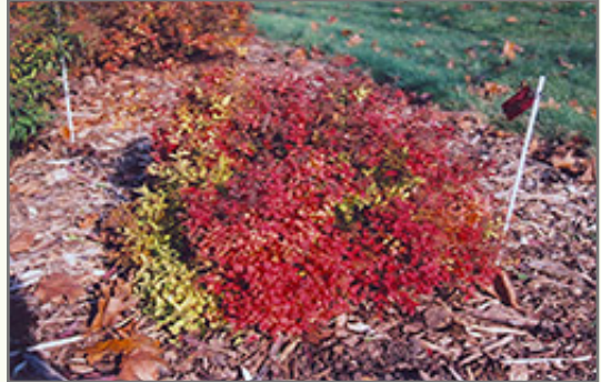
Dakota Goldcharm® Spirea in fall