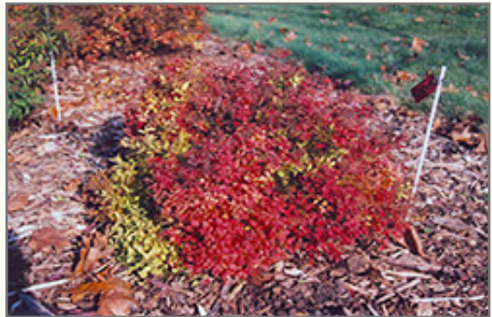
Dakota Goldcharm® Spirea in fall