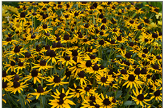
Little Goldstar Black Eyed Susan flowers