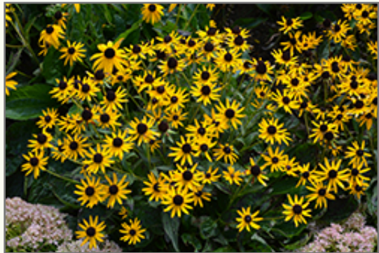
Little Goldstar Black Eyed Susan in bloom

Little Goldstar Black Eyed Susan is an herbaceous perennial with an upright spreading habit of growth. Its medium texture blends into the garden, but can always be balanced by a couple of finer or coarser plants for an effective composition.