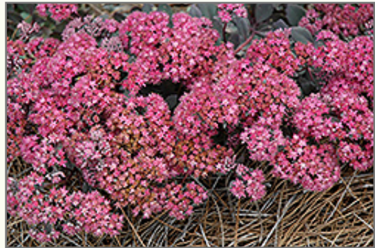
SunSparkler® Dazzleberry Sedum flowers

SunSparkler® Dazzleberry Sedum is a dense herbaceous perennial with an upright spreading habit of growth. Its medium texture blends into the garden, but can always be balanced by a couple of finer or coarser plants for an effective composition.