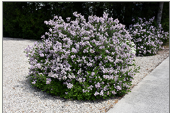
Dwarf Korean Lilac in bloom