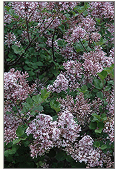
Dwarf Korean Lilac flowers

This is a high maintenance shrub that will require regular care and upkeep, and should only be pruned after flowering to avoid removing any of the current season's flowers. It is a good choice for attracting butterflies to your yard. It has no significant negative characteristics.