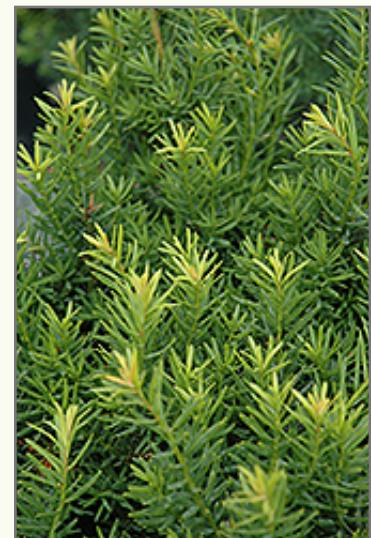
Nova Japanese Yew foliage