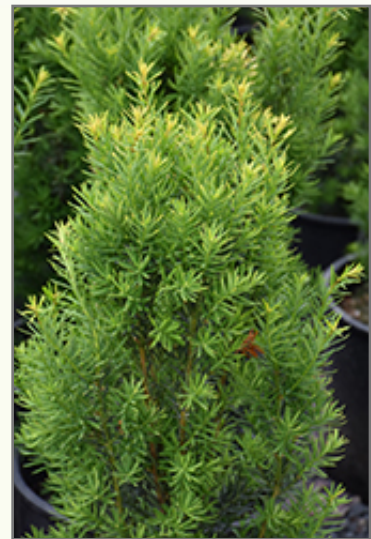
Nova Japanese Yew