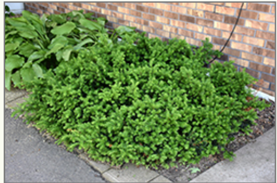
Emerald Spreader® Japanese Yew