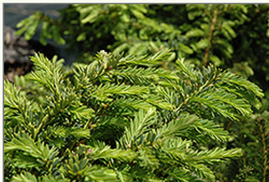
Emerald Spreader® Japanese Yew foliage