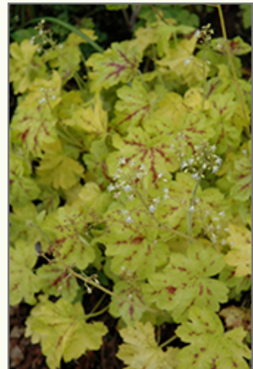
Solar Power Foamy Bells flowers