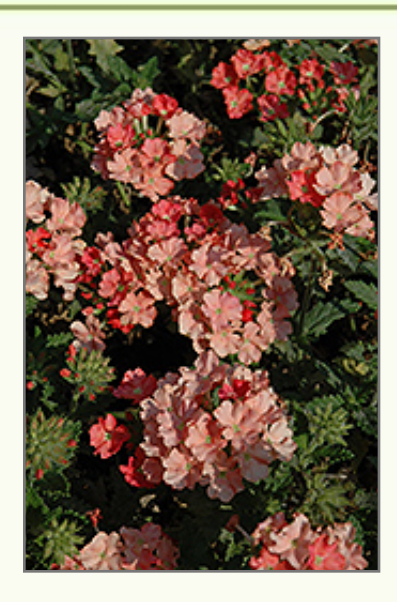
Empress Peach Verbena flowers

Height: 12 inches Spread: 24 inches Spacing: 18 inches Sunlight: O Hardiness Zone: (annual) Other Names: Vervain Group/Class: Empress Series