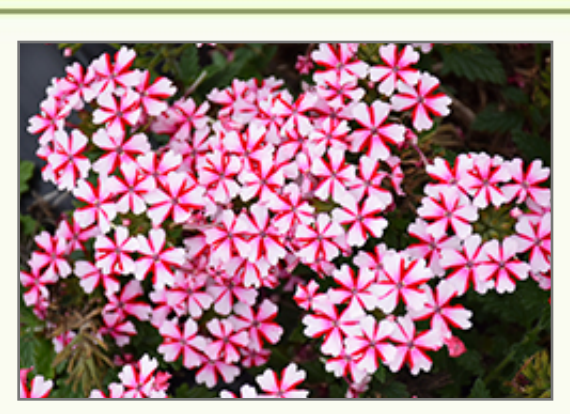
Lanai Candy Cane Verbena flowers