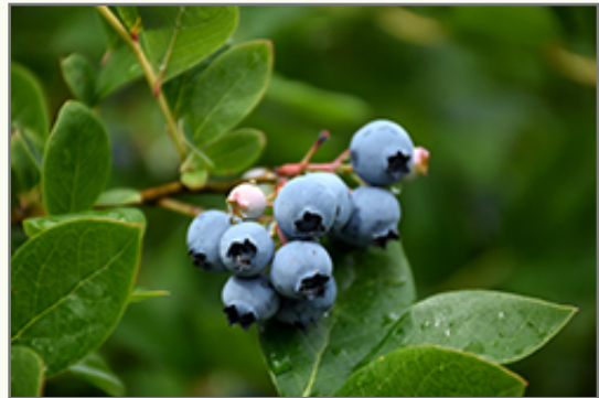
Northcountry Blueberry fruit