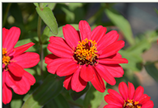
Profusion Double Hot Cherry Zinnia flowers

Profusion Double Hot Cherry Zinnia is recommended for the following landscape applications;