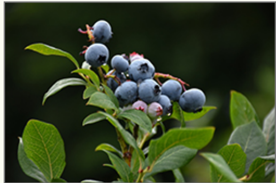
Northland Blueberry fruit