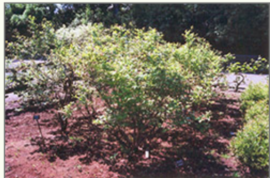
Northland Blueberry