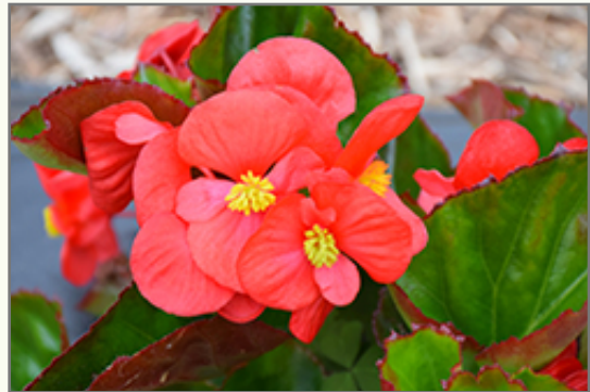
Big Red Green Leaf Begonia flowers

Big Red Green Leaf Begonia is an herbaceous annual with an upright spreading habit of growth. Its medium texture blends into the garden, but can always be balanced by a couple of finer or coarser plants for an effective composition.