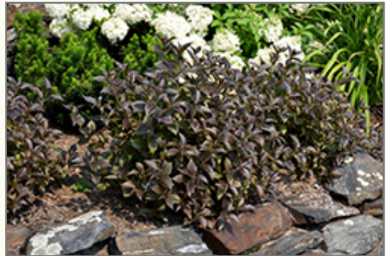
Tango Weigela

Tango Weigela will grow to be about 24 inches tall at maturity, with a spread of 3 feet. It tends to fill out right to the ground and therefore doesn't necessarily require facer plants in front. It grows at a medium rate, and under ideal conditions can be expected to live for approximately 30 years.