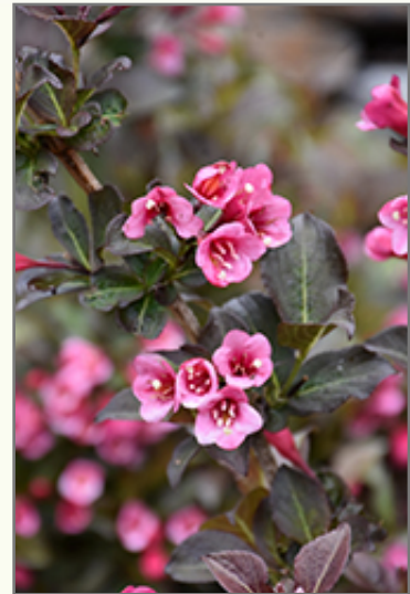
Tango Weigela flowers

This shrub will require occasional maintenance and upkeep, and should only be pruned after flowering to avoid removing any of the current season's flowers. It is a good choice for attracting hummingbirds to your yard. It has no significant negative characteristics.