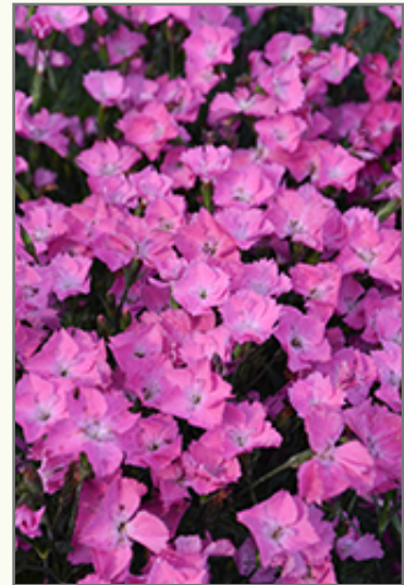
Kahori Dianthus flowers

This is a high maintenance plant that will require regular care and upkeep, and is best cleaned up in early spring before it resumes active growth for the season. It is a good choice for attracting bees and butterflies to your yard, but is not particularly attractive to deer who tend to leave it alone in favor of tastier treats. It has no significant negative characteristics.