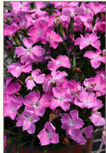
Kahori Dianthus flowers