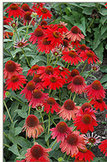
Sombrero® Salsa Red Coneflower flowers

Sombrero® Salsa Red Coneflower is an herbaceous perennial with an upright spreading habit of growth. Its medium texture blends into the garden, but can always be balanced by a couple of finer or coarser plants for an effective composition.