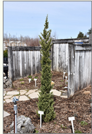
Trautman Juniper