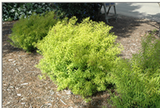
Mellow Yellow Spirea

Mellow Yellow Spirea is a multi-stemmed deciduous shrub with a shapely form and gracefully arching branches. It lends an extremely fine and delicate texture to the landscape composition which can make it a great accent feature on this basis alone.