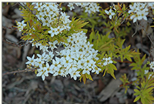
Mellow Yellow Spirea flowers