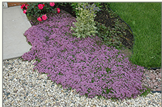
Red Creeping Thyme in bloom