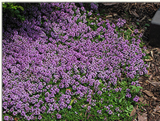
Purple Carpet Creeping Thyme in bloom