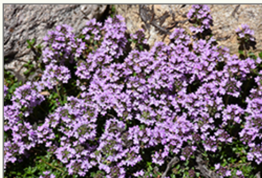
Purple Carpet Creeping Thyme flowers

Purple Carpet Creeping Thyme is a dense herbaceous evergreen perennial with a ground-hugging habit of growth. It brings an extremely fine and delicate texture to the garden composition and should be used to full effect.