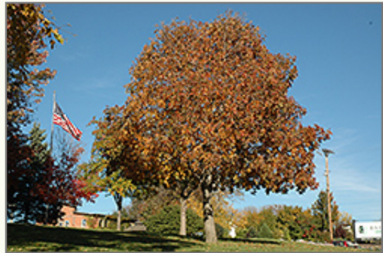
Autumn Splendor Buckeye in fall