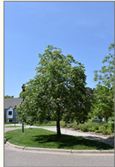
Autumn Splendor Buckeye