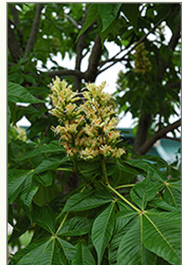
Autumn Splendor Buckeye flowers