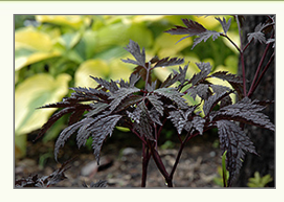
Chocoholic Snakeroot foliage

Other Names: Bugbane, Black Cohosh, Actaea racemosa