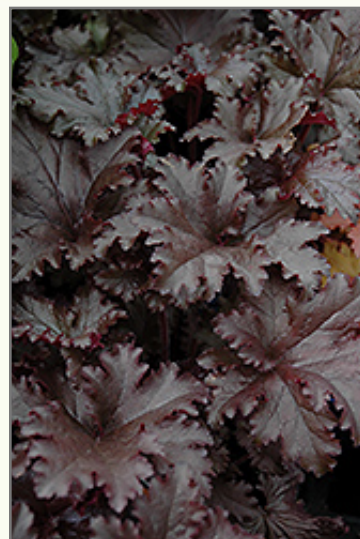
Black Taffeta Coral Bells foliage

Black Taffeta Coral Bells is recommended for the following landscape applications;