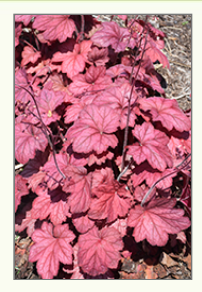
Georgia Plum Coral Bells foliage

This is a relatively low maintenance plant, and should be cut back in late fall in preparation for winter. It is a good choice for attracting hummingbirds to your yard. It has no significant negative characteristics.