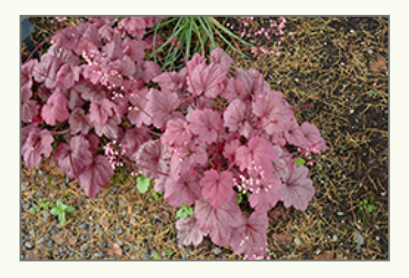
Georgia Plum Coral Bells

Georgia Plum Coral Bells is recommended for the following landscape applications;