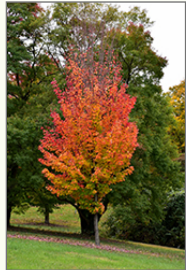
Red Rocket Red Maple in fall

Red Rocket Red Maple is a dense deciduous tree with a narrowly upright and columnar growth habit. Its average texture blends into the landscape, but can be balanced by one or two finer or coarser trees or shrubs for an effective composition.